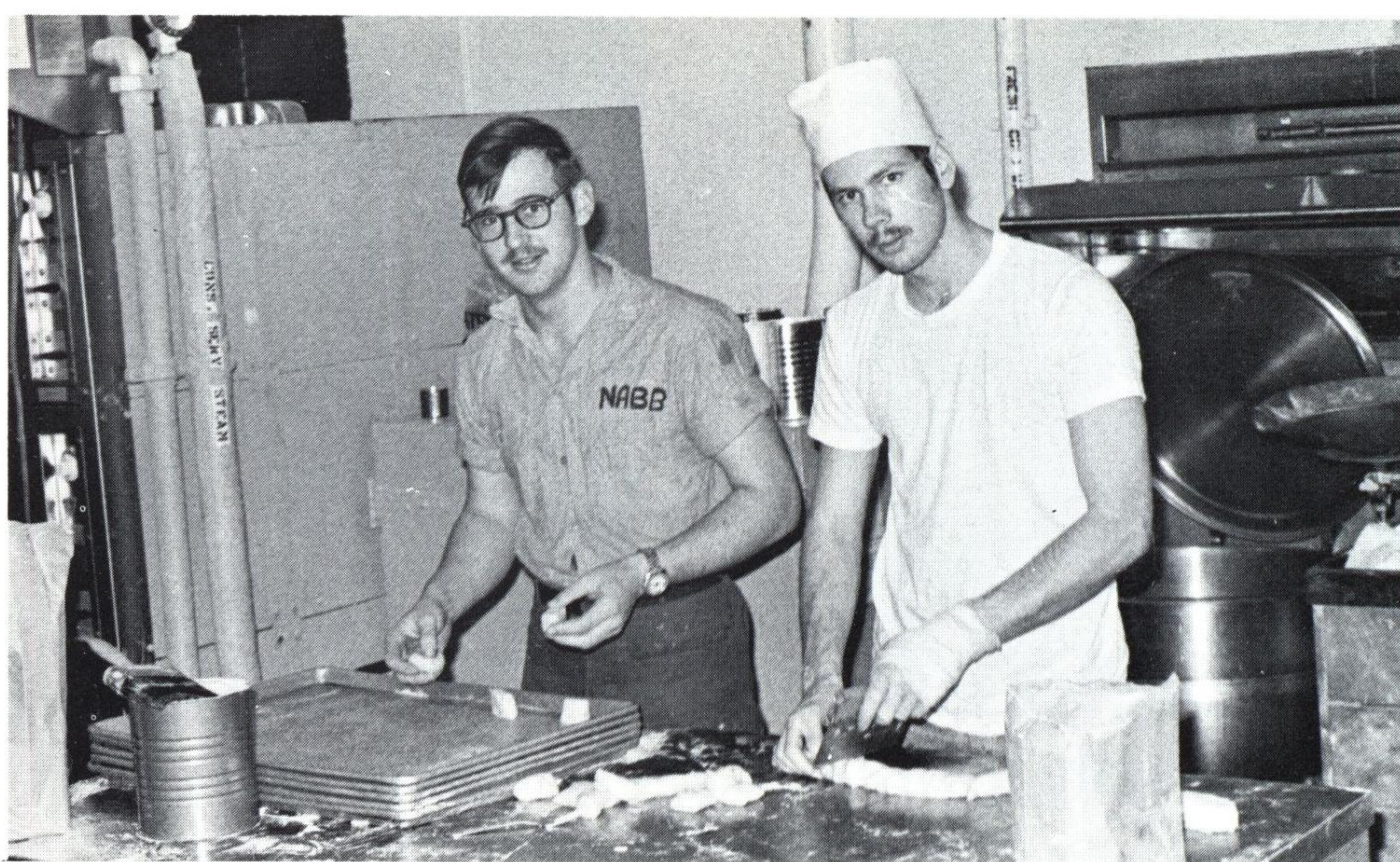
The CAMDEN Bakery

The other segment of S-2 is made up of the Wardroom Stewards. They insure that the Wardroom living spaces and galley are neat and clean, and just one sampling of their well-prepared food will convince the most chronic doubter that they are the best cooks in Southeast Asia.