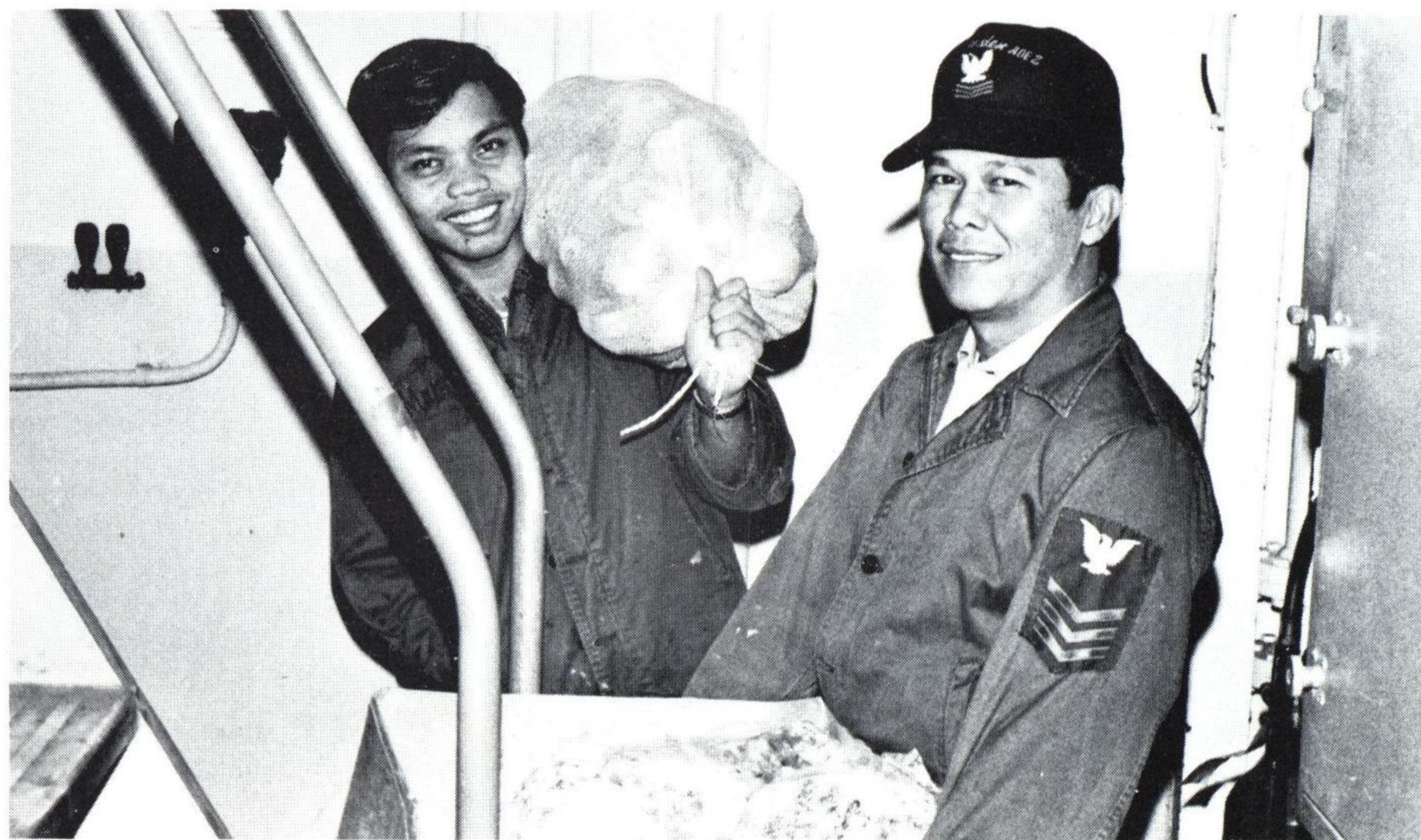
Bringing Home the Bacon