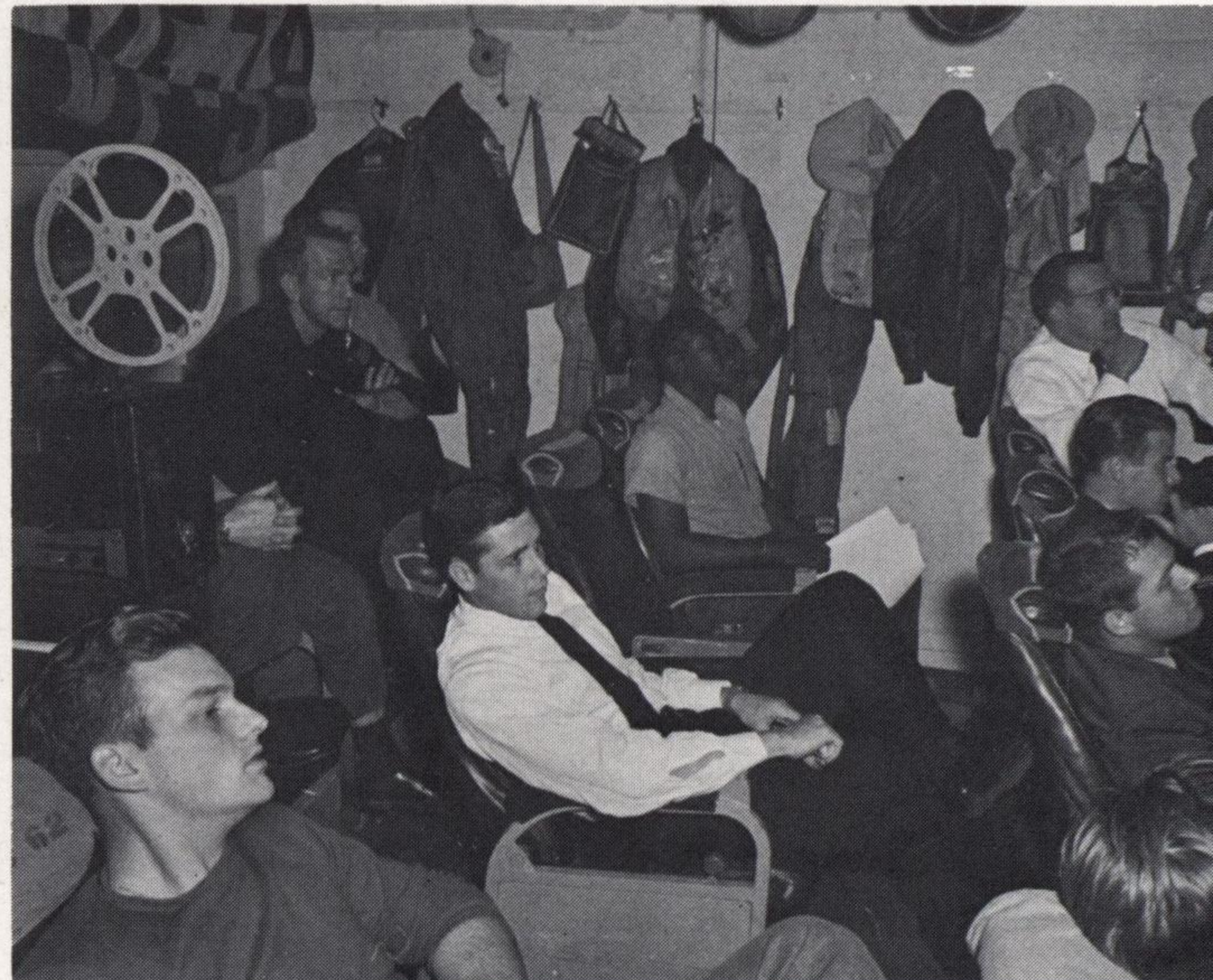
▲ For relaxation, ready room flick