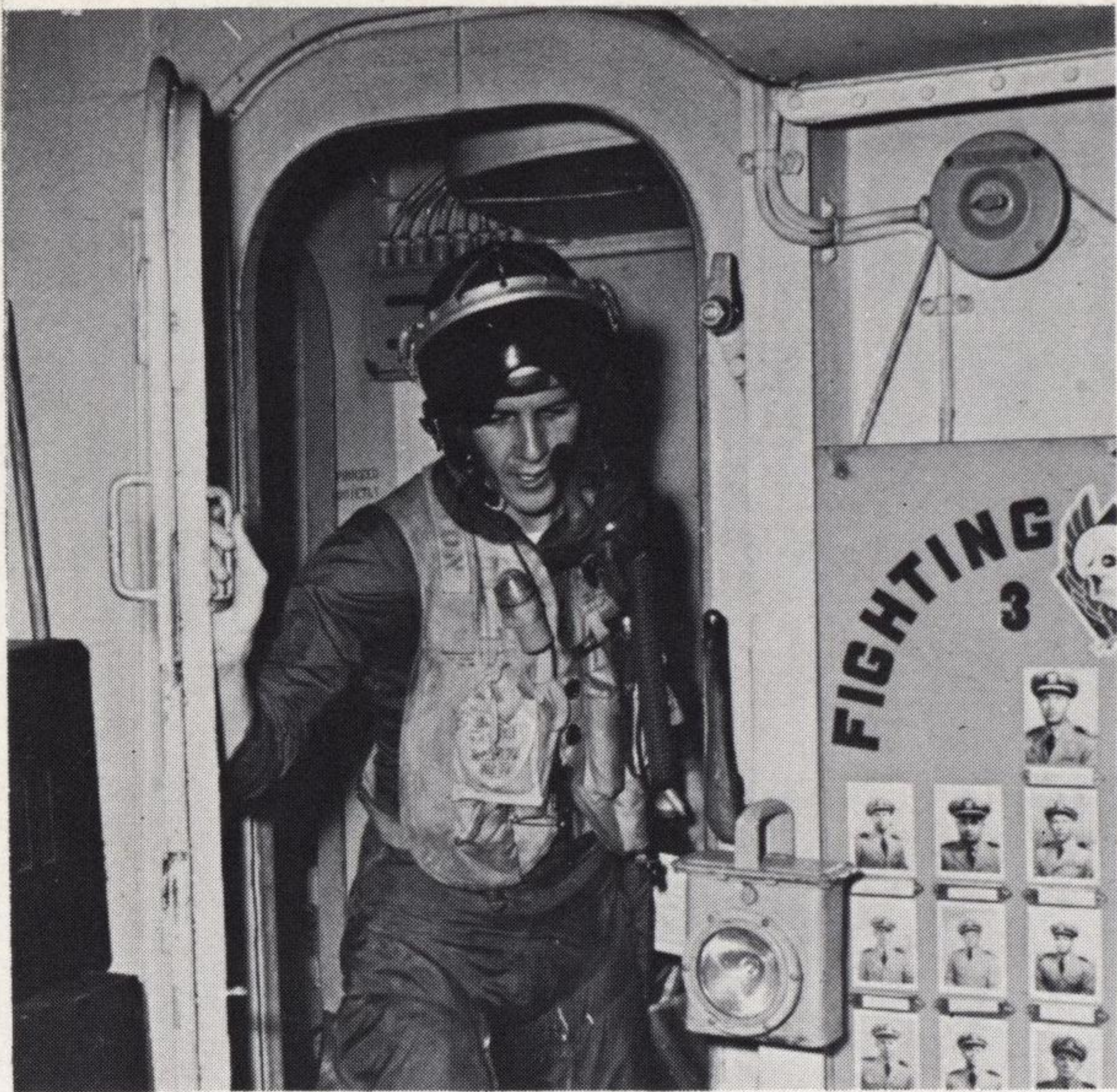
Beat, bedraggled and butt-sore ▲