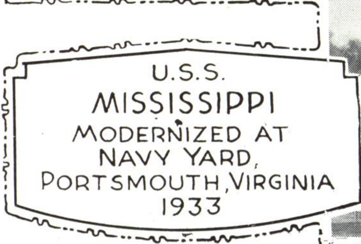
U. S. S. MISSISSIPPI MODERNIZED AT NAVY YARD, PORTSMOUTH, VIRGINIA 1933