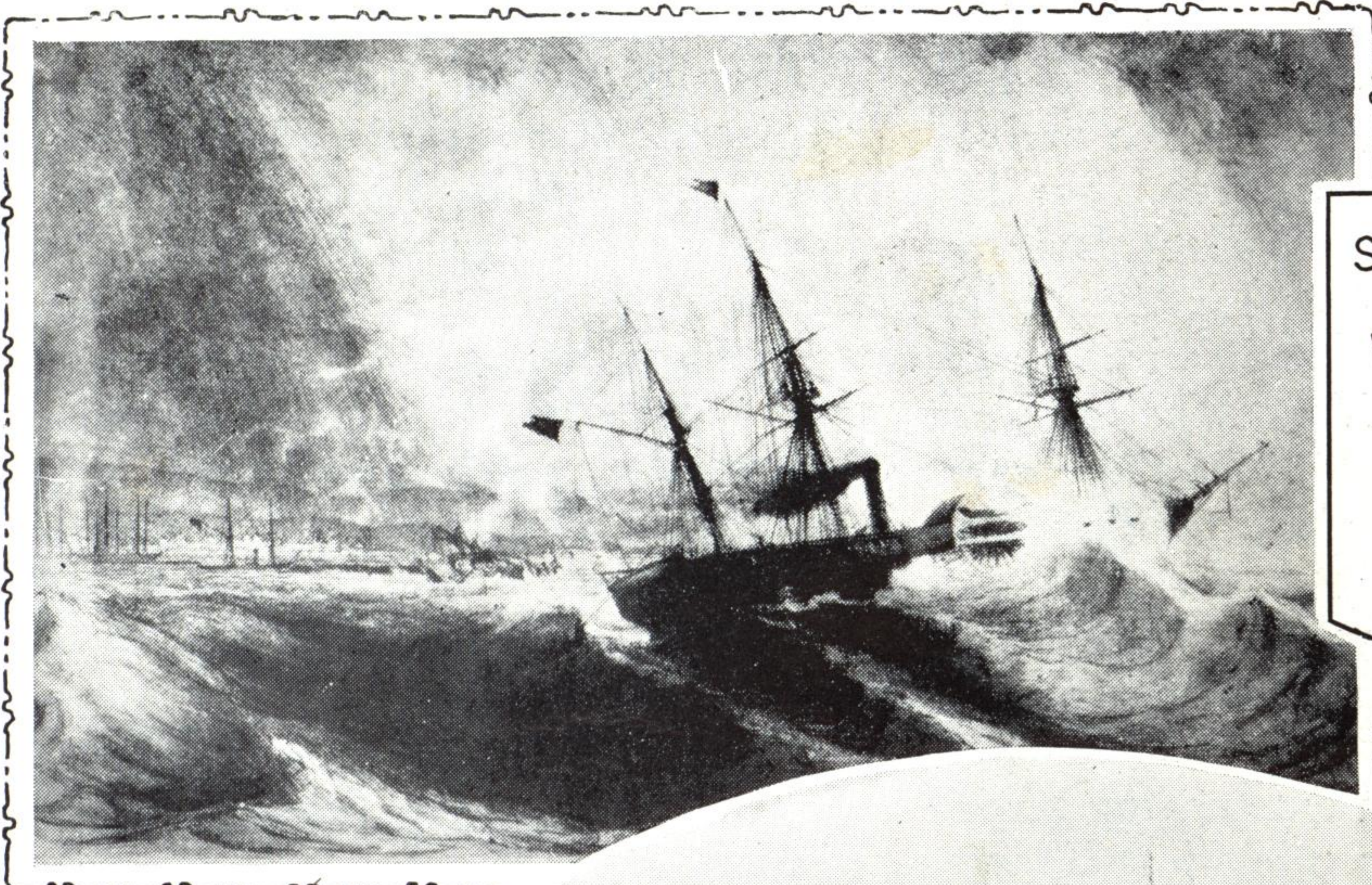
U. S. STEAM FRIGATE MISSISSIPPI WOODEN BARQUE- RIGGED VESSEL, 3220 TONS. BUILT AT PHILADELPHIA, IN 1839