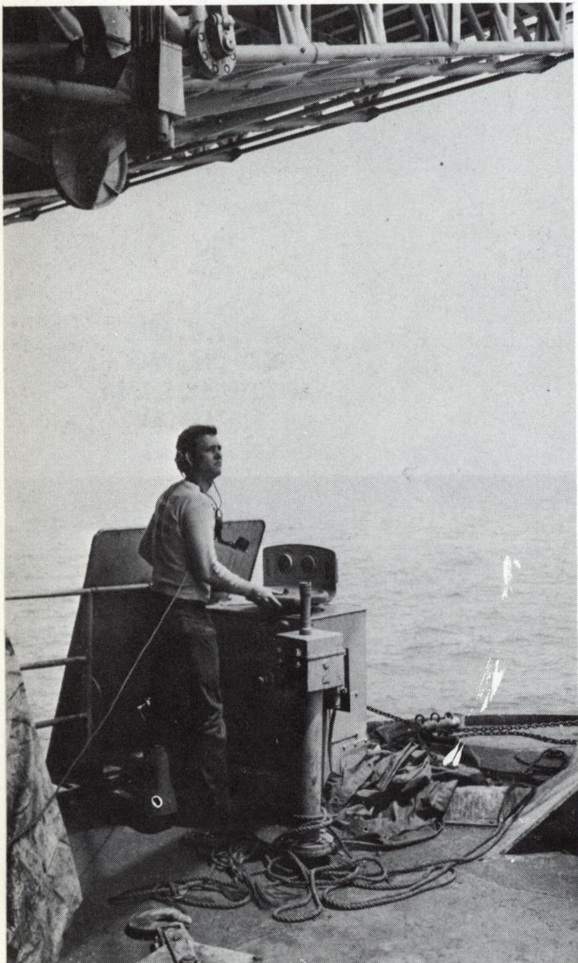
Unstowing the B&A crane

In-port, V-3 Division is responsible for the upkeep and maintenance of the hangar bays including the quarterdeck and after brow area.