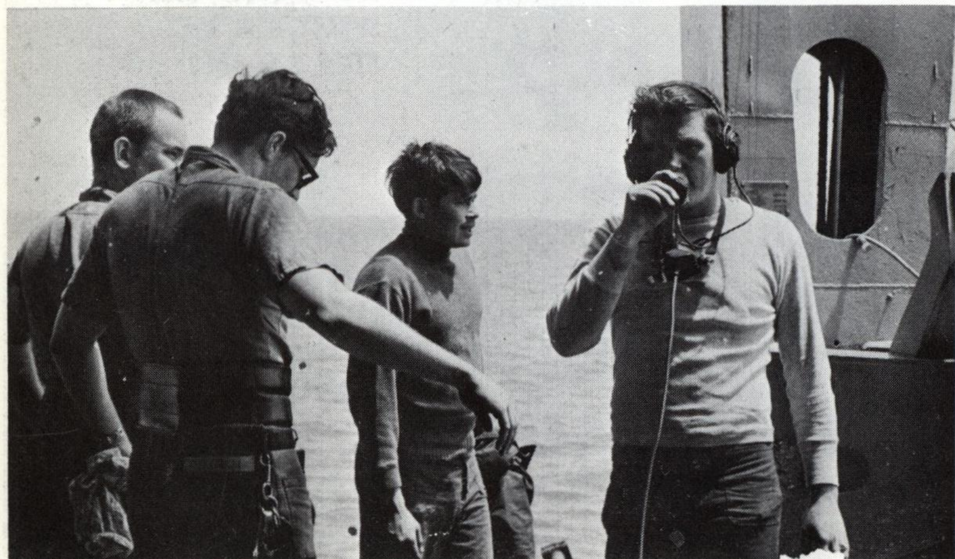
Prepare to unstow B&A crane