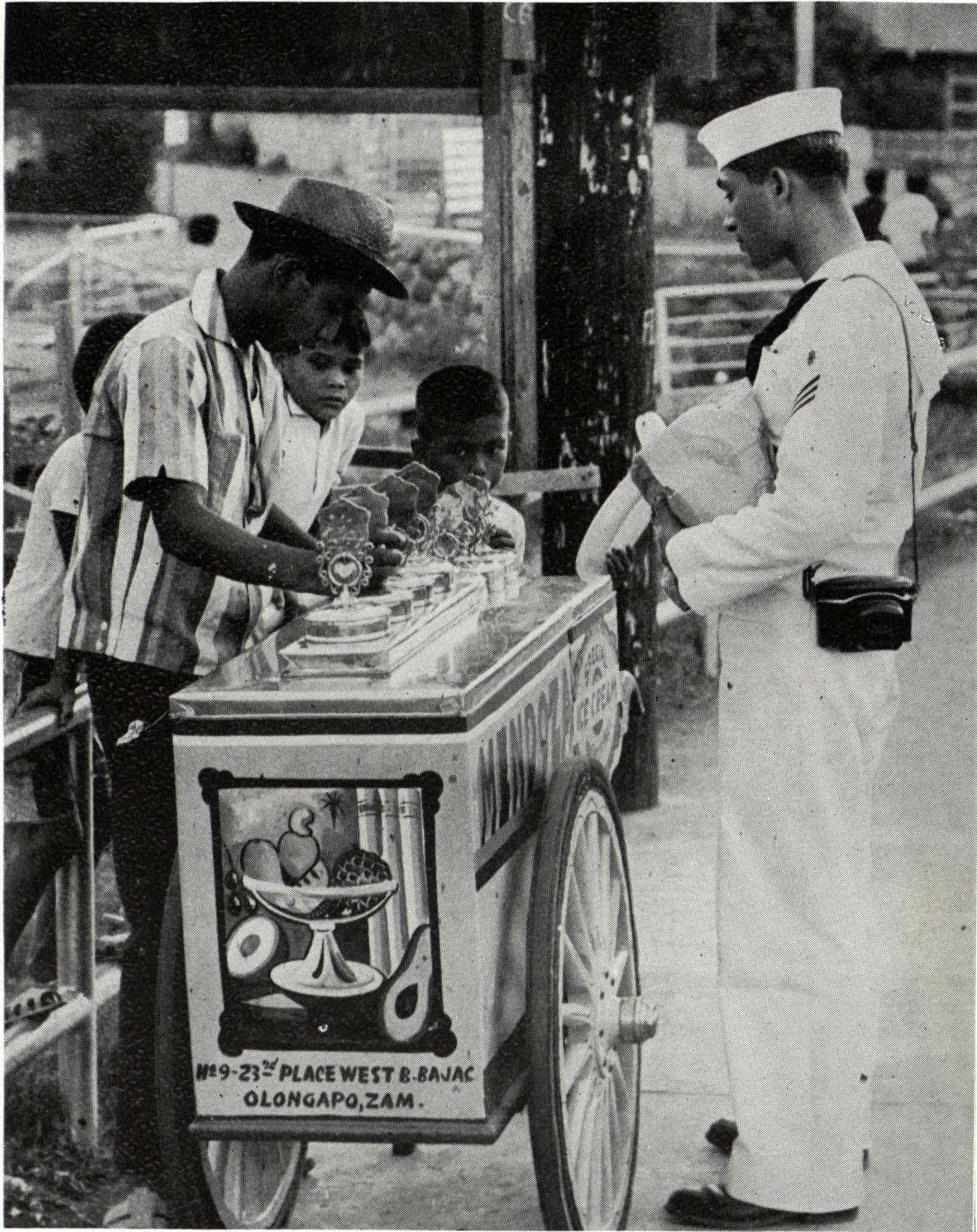
Olongapo: Filipino ice-cream vendor . . .