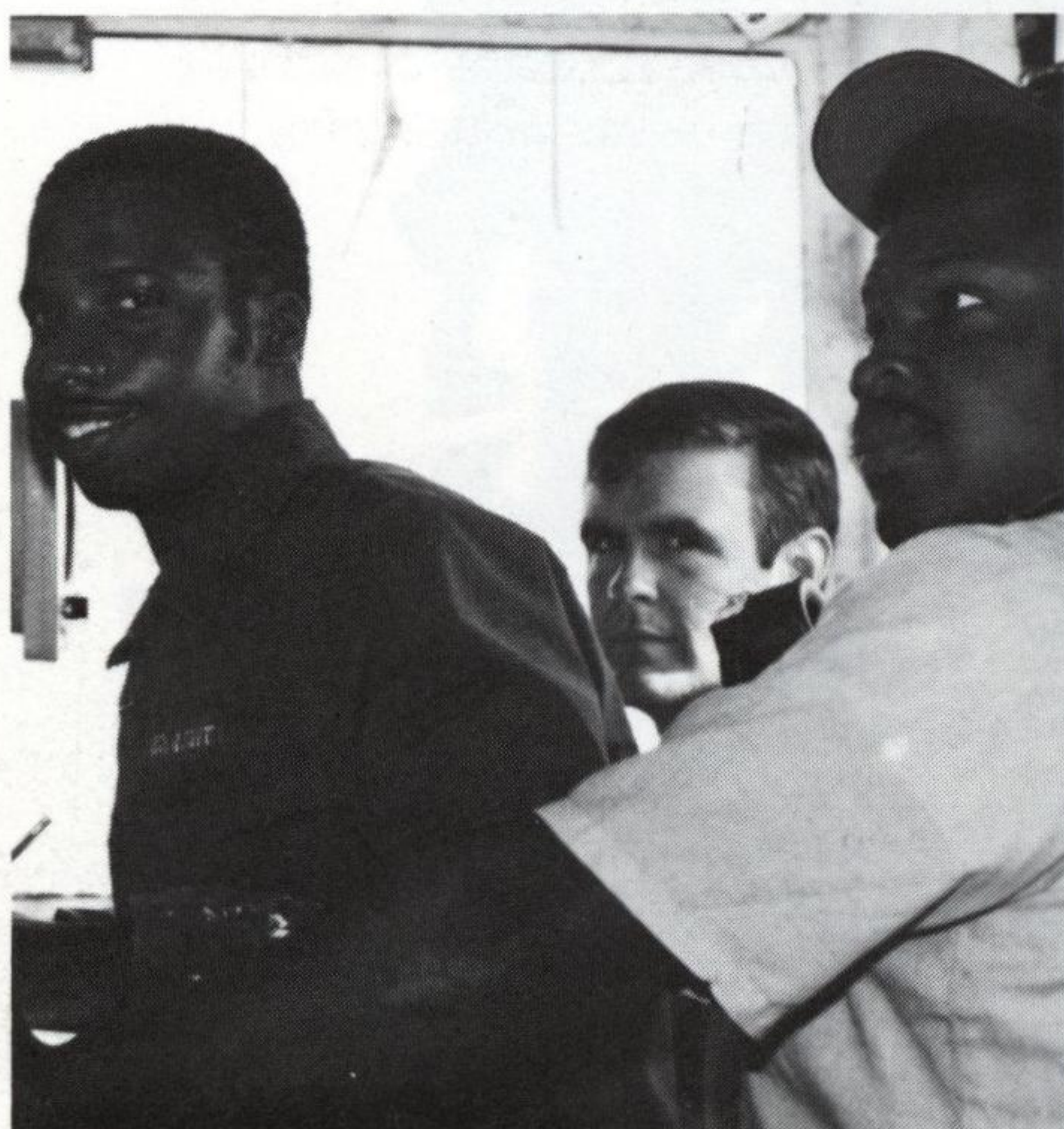
Helo Control Tower manned and ready

"Flight Quarters, Flight Quarters, all hands man your flight quarters stations to launch LAMPS helo. The smoking lamp is out on all weatherdecks. Wear no hats topside, throw no articles over the side. All personnel not involved with flight quarters stand clear of the weatherdecks aft of the boat davits. Now Flight Quarters."