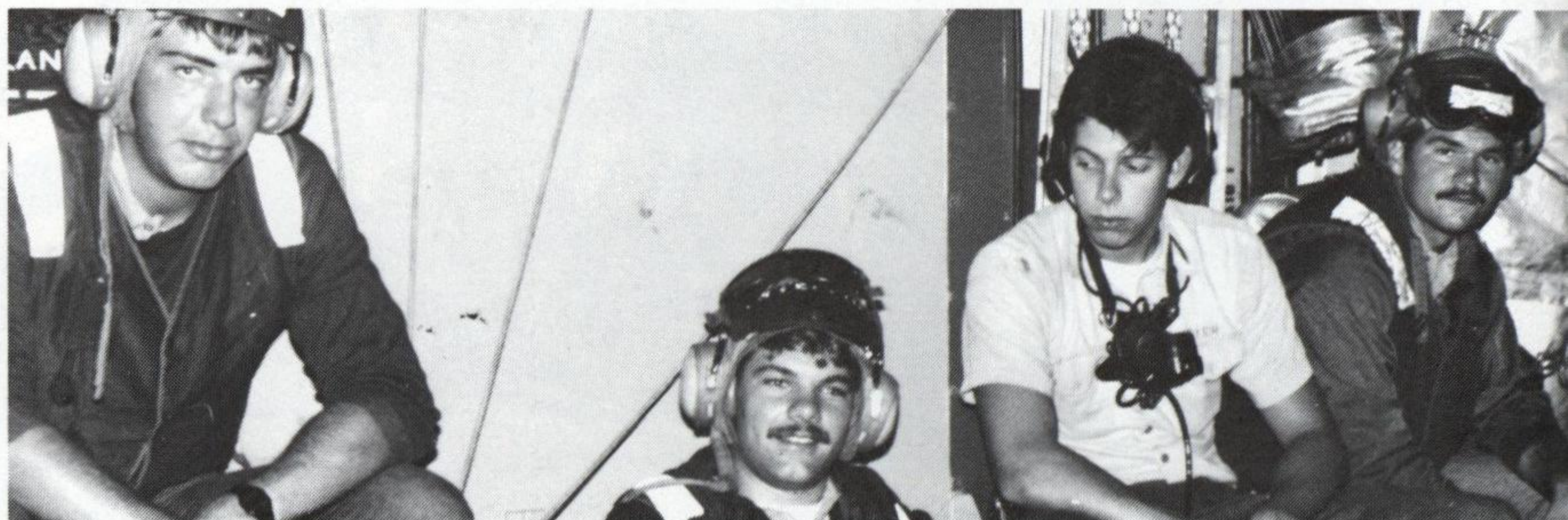
Fire party standing by in case of an emergency

With HSL35 Det 9 embarked on-board, it was practically a daily event to launch and recover the SH-2F 'LAMPS' helo code-named MAGUS 36. Flight Quarters involves a large number of crewmembers, from the Landing Signal Enlisted on the flight deck to the Anti-Submarine Air Controller in CIC. The professional performance of all hands involved resulted in 787 safe landings for MAGUS 36. Well Done!