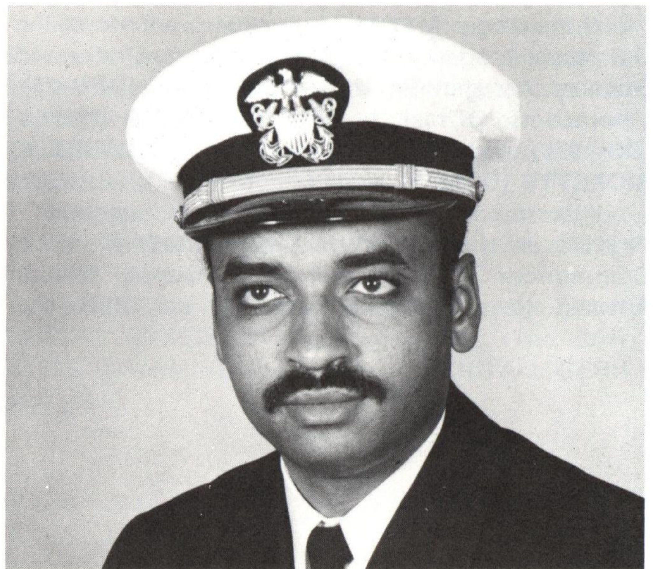
EXECUTIVE OFFICER (PRESENT)