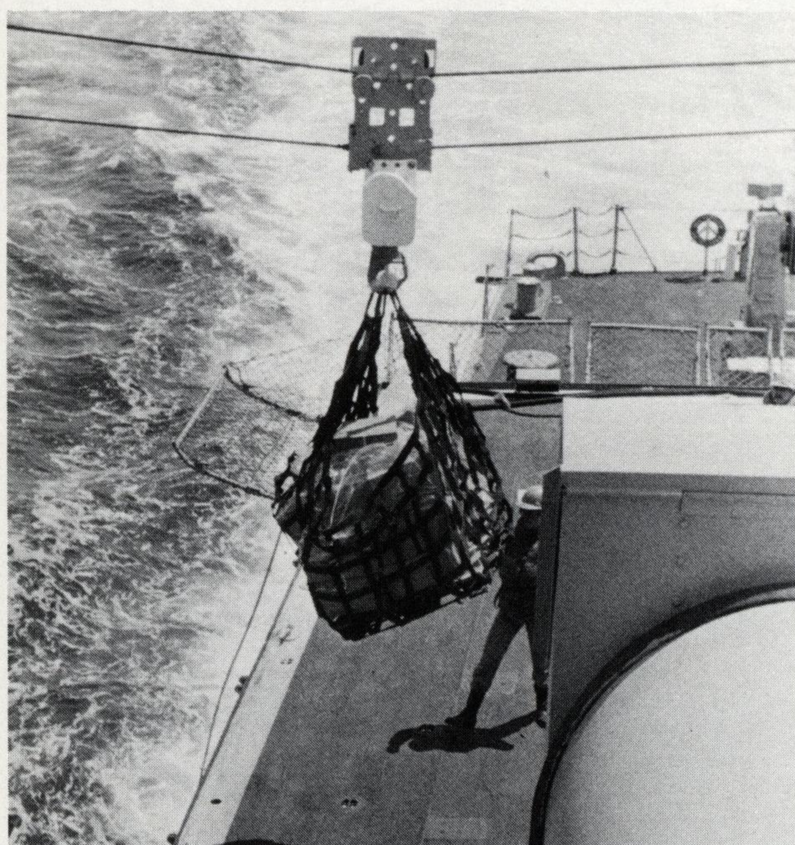
Stores are secured to wooden pallets and transferred in cargo nets.

Underway replenishments at sea are both a blessing and a curse. Usually every three days, elements of the Battle Group cluster around their precious stores ship & receive fuel, food, & most importantly, mail. Unfortunately, these UNREPS usually occur at night or on Sunday, a traditional day of rest, even at sea. There is just nothing like getting up at 0100 for a 0200-0400 refueling evolution with the cold and wet whipping at your clothes; the slightest shelter from the wind is exquisite relief. Danger lurks there, too, for a parting line or an unexpected wave could sweep someone into the water in the blink of an eye. Vigilance, training, and discipline are the key ingredients which allow us to safely replenish time after time