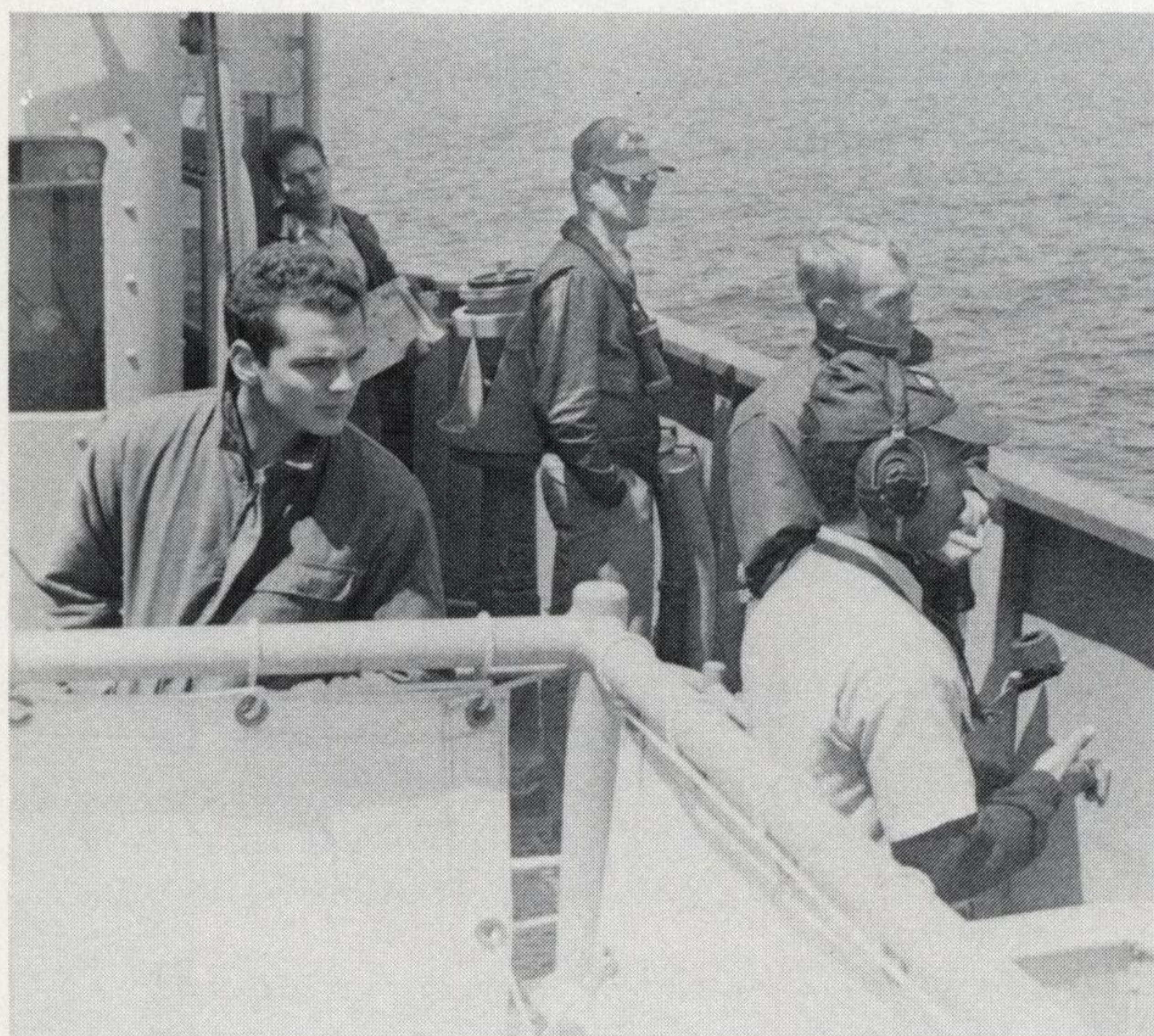
Captain & crew watch intently as ships maneuver within 140 feet of each other