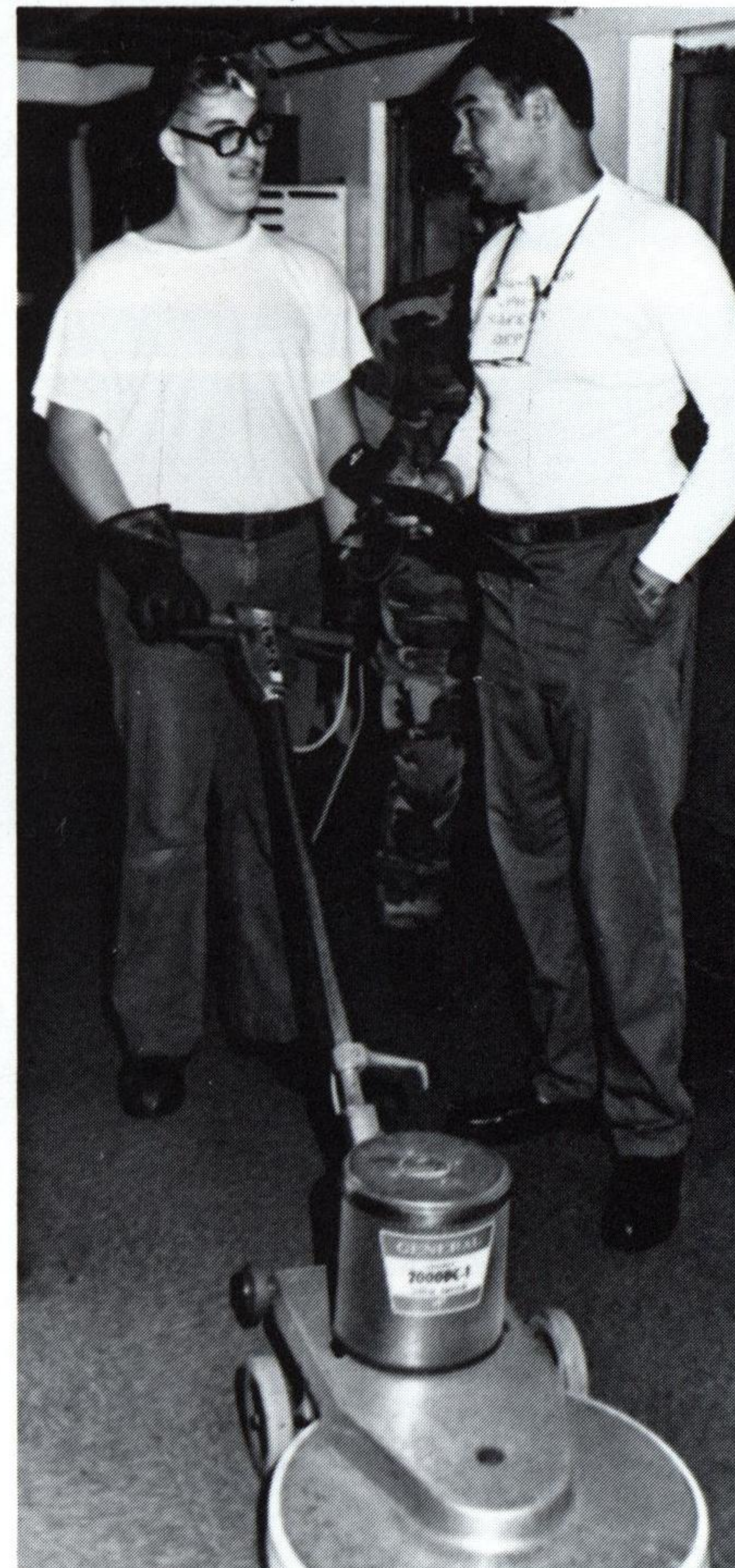
Right: Safety is an "all hands" job that requires each of us to be constantly on the alert for safety hazards.