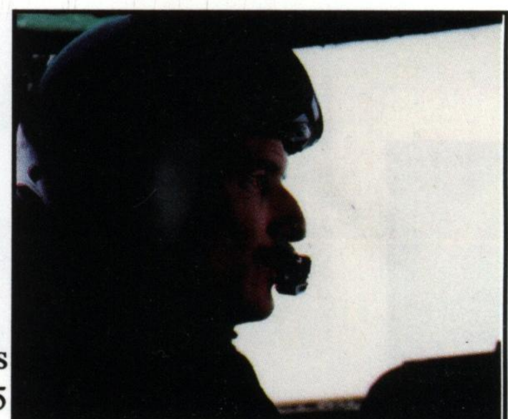
"Weasel" takes to the skies with HM-15